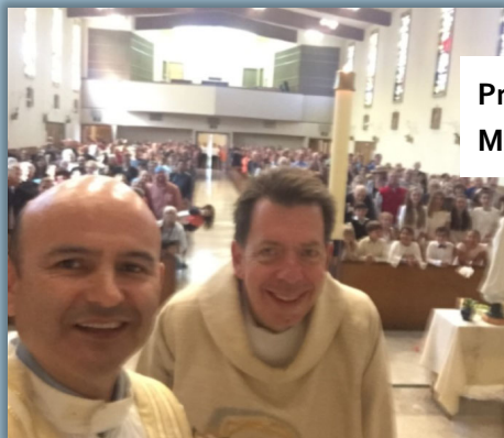
Prayer Walk Opening Mass May 13, 2017

Volunteers are needed to help with ticket sales, set-up, clean-up, preparing and serving food, and to be walk partners. Interested? Email olfwalkthecross@gmail.com